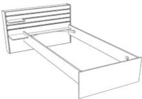
3580L290 : L122 x H89 x P217; Weight : 38kg - Volume : 0,081m3; Number of packages : 2