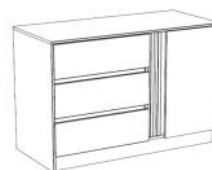
3580COPT : L110 x H77 x P50. Weight : 42 kg - Volume : 0,084m3. Number of packages : 2